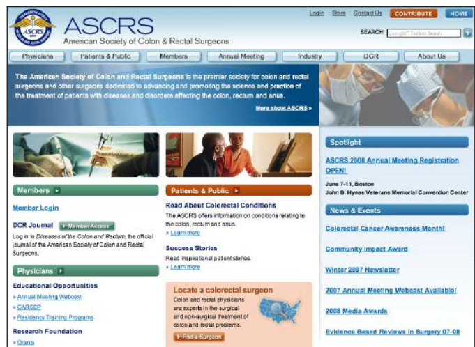
Society’s new homepage at www.fascrs.org