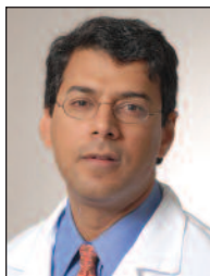
Dr. Atul Gawande