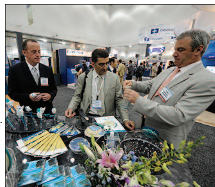
▶ A record 893 exhibitors drew scores of Tripartite Meeting attendees to the Exhibit Hall during ASCRS' five-day stay in Boston.