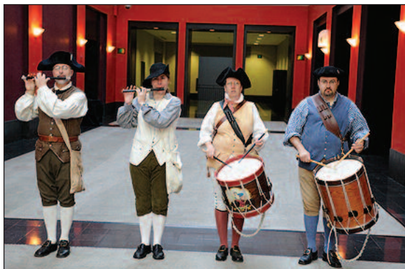
◀ Boston's Tripartite Meeting guests were welcomed by a colonial drum and fife troupe during the meeting's opening session.