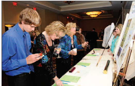
Welcome Reception attendees submit bids for items at the Research Foundation Silent Auction.

Grants, the International Fellowship and the Norman Nigro Research Lecture. It will also support the Request for Proposal for Clinical Studies on Benign Colorectal Disorders program.