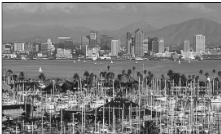
A blend of emerging therapies, popular sessions from past ASCRS Meetings and plenty of California sun will guide this year's scientific program