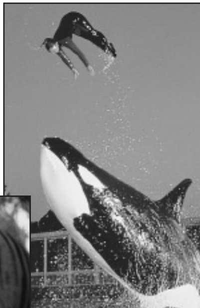
See the dazzling acrobatics of Killer Whales at Sea World and witness the jungle’s fiercest predators up close at San Diego’s world-famous zoo

names and traditional Mexican jewelry and leather goods. Enjoy an authentic Mexican lunch, then wash it down with a margarita! *